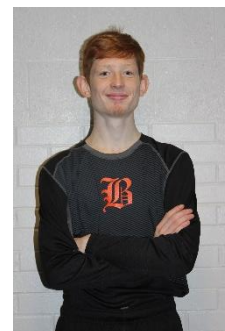
Maison Krieger 116